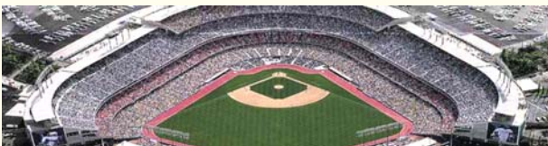
Dodgers vs. Arizona Diamondbacks Thursday, March 28th at 1:10 PM