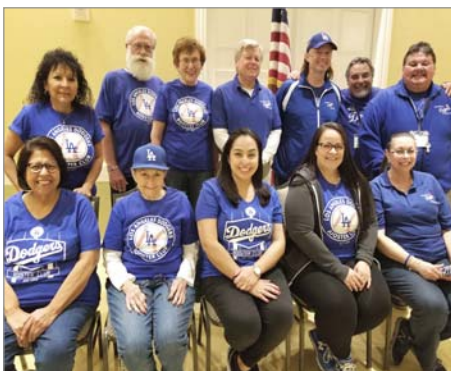
2019 Booster Club Board